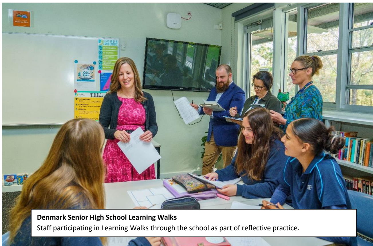
Denmark Senior High School Learning Walks

By the end of 2025, the school will achieve a high level of consistency across all Learning Areas in implementing Special Educational Needs (SEN) planning and reporting practices, effectively addressing the diverse learning needs of our SEN students.