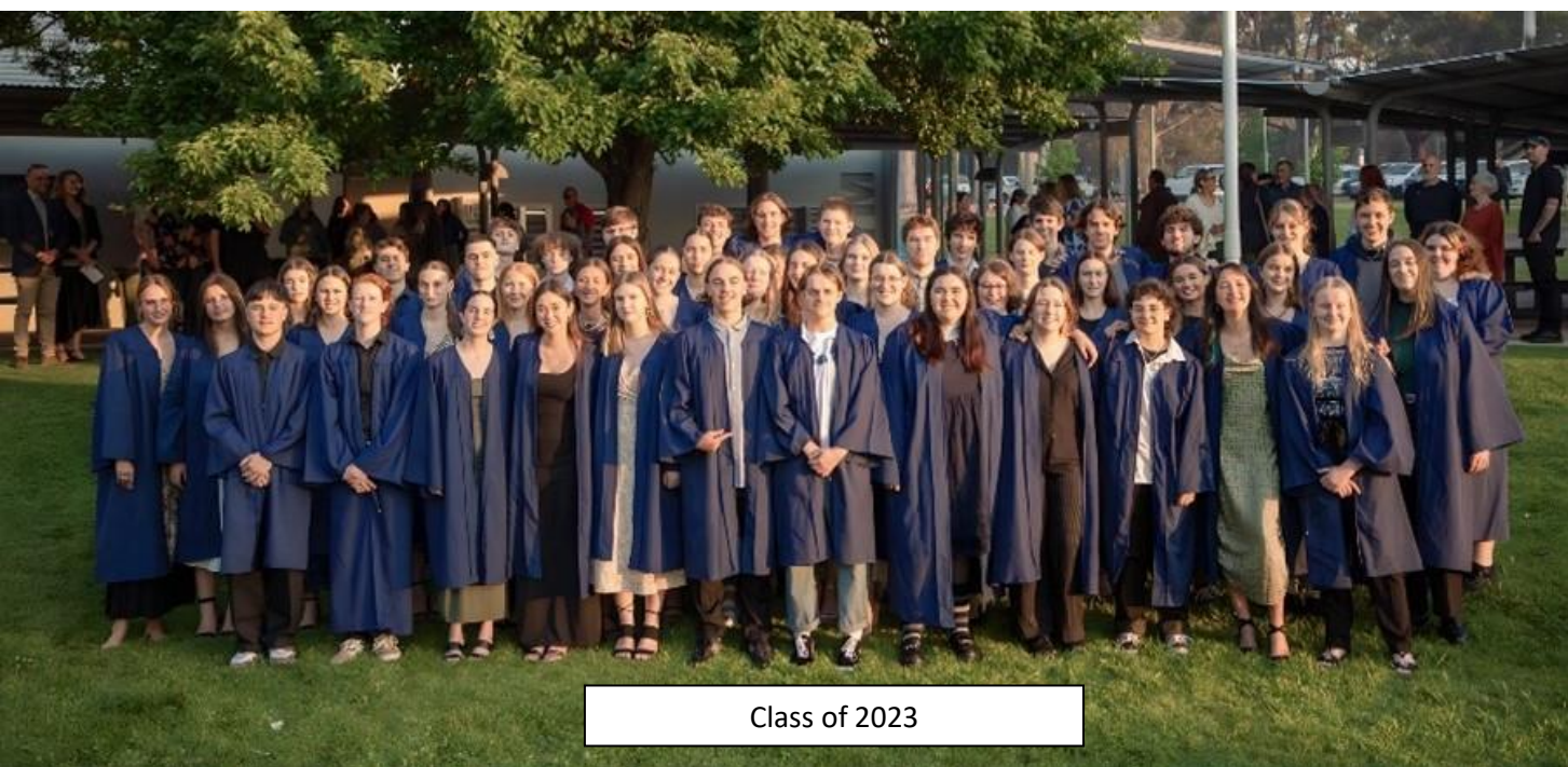
Class of 2023

We align with the Department of Education Strategic Directions for Public Schools 2020 - 2024, the Building on Strength: future directions for the Western Australian public school system, and associated Focus documents. We also acknowledge and embrace the views of our parents, caregivers, and broader community. We actively seek evidence-based interventions that will further our planned intentions for continuous improvement and engage in regular and robust review processes to monitor our progress and respond to findings.