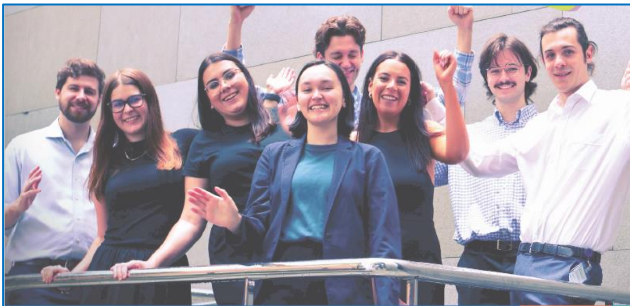
2023 Graduate Cohort

It doesn't matter whether you have graduated or are soon to graduate in Accounting and Finance, Economics, Commerce, Law, International Relations, Data Science, Environmental Science, or some other discipline, we are keen to hear from Graduates from all different backgrounds and disciplines. At Department of Treasury (Treasury), you will build an exciting career where you will have the opportunity to perform challenging and interesting work on a range of high-profile State projects and tasks.