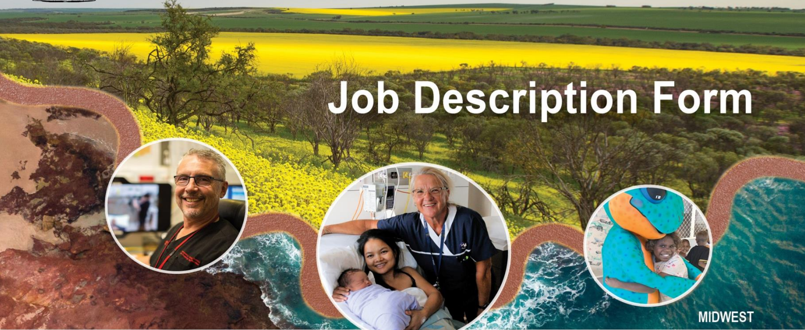
Landscape Photos: Tourism Western Australia