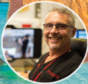
Community | Compassion | Quality