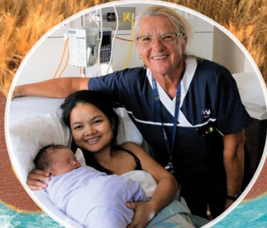
Integrity | Equity | Curiosity