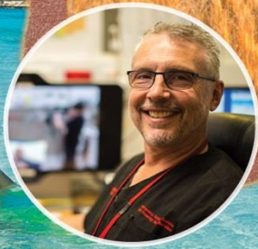
Community | Compassion | Quality