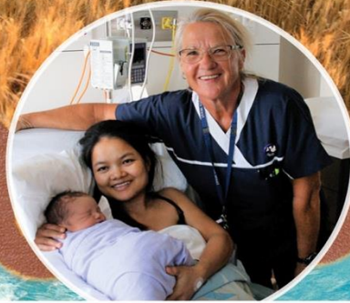
Integrity | Equity | Curiosity