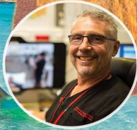
Community | Compassion | Quality