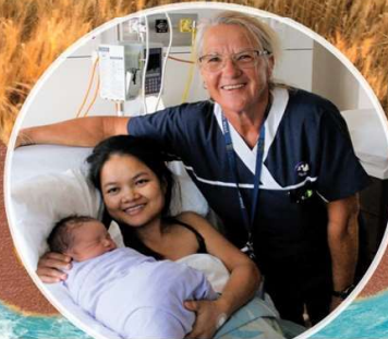
Integrity | Equity | Curiosity