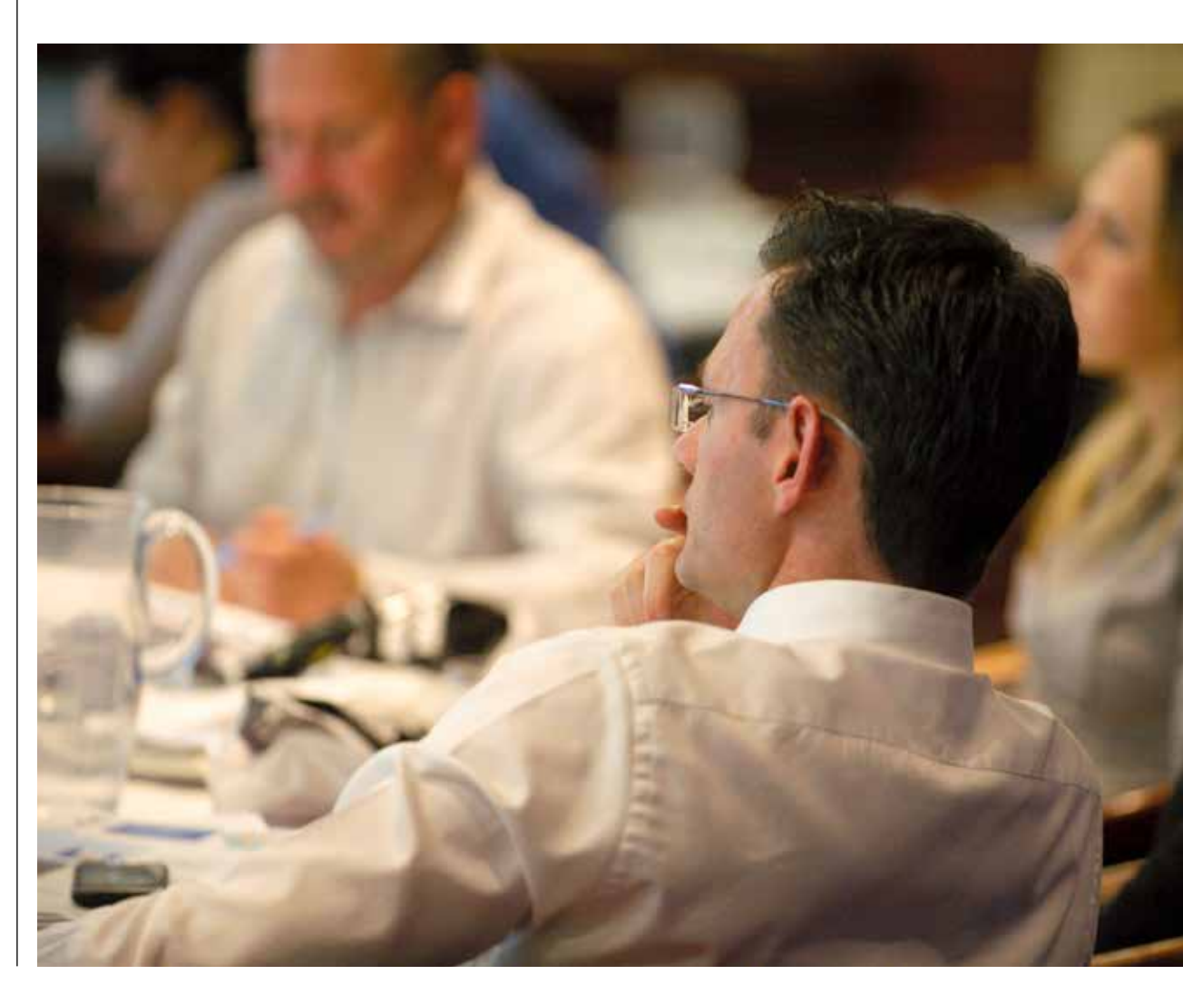
We offer a supportive and flexible culture

At Main Roads, we've been at the leading edge of employing innovation and are actively moving towards creating a greater awareness of, and engagement in, innovation as part of how we do our work. Everyone is encouraged to be innovative, for example, our graduates are all required to work in groups on innovation projects as part of the Development Employee Leadership Program.