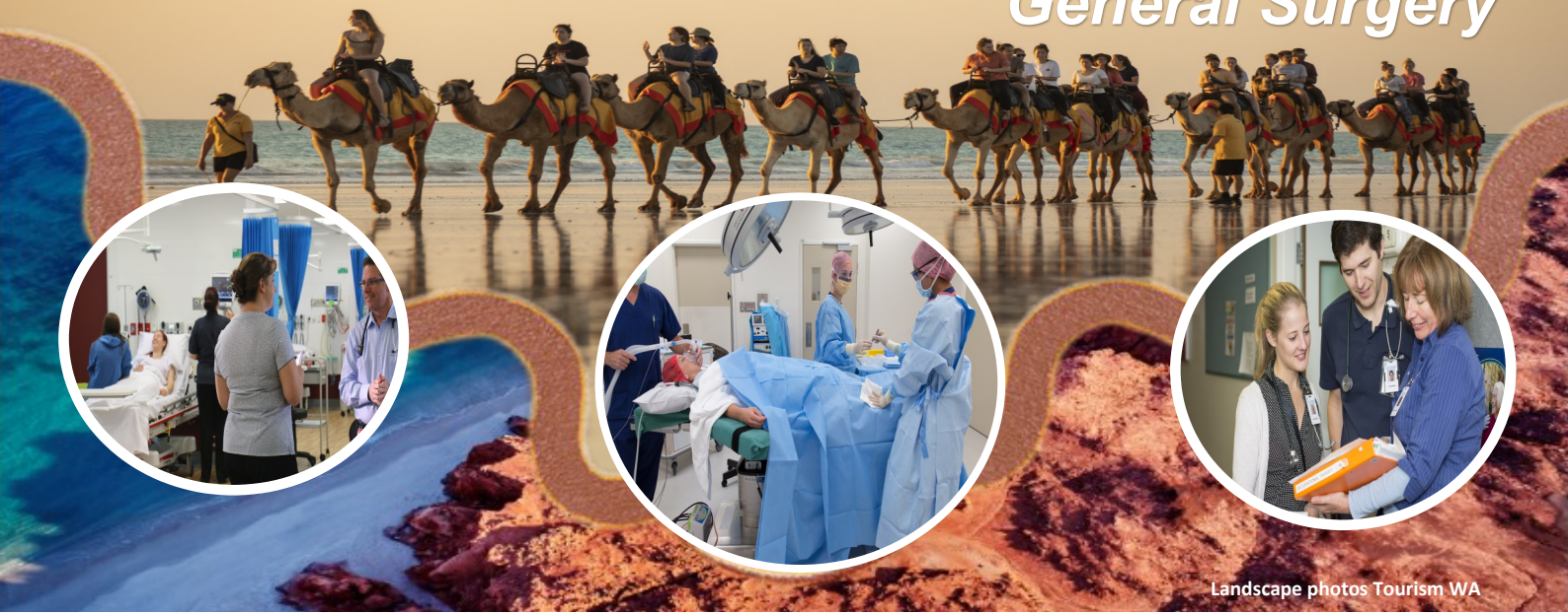
Landscape photos

WA Country Health Service (WACHS) is seeking to appoint a suitably experienced person to the position of Consultant Surgeon - General Surgery to join the team in the Kimberly region. This is a Fixed Term Full Time appointment for up to 5 years, with the possibility of extension(s).