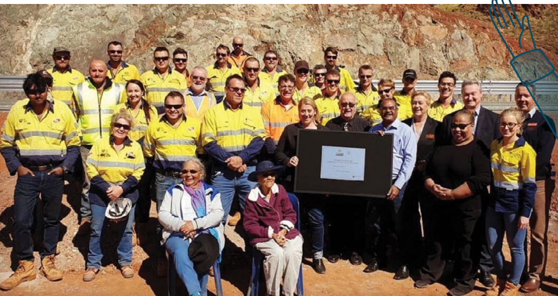
Main Roads – Regional Engineering Associate Traineeship Program