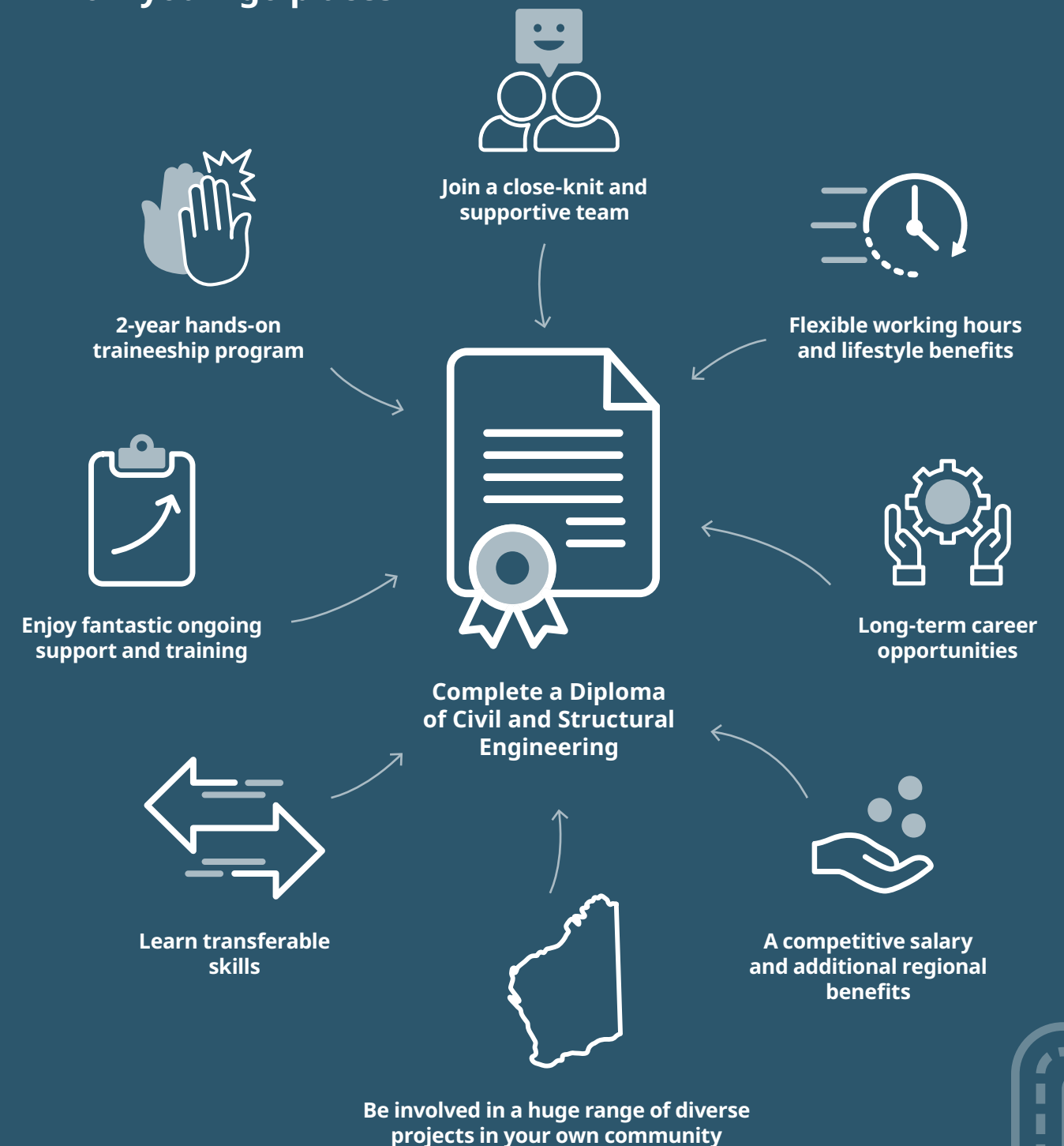
Regional Engineering Associate Traineeship Program – Main Roads