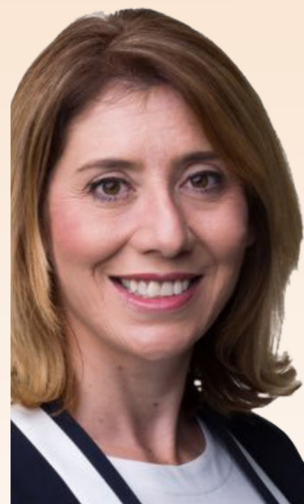
Minister for PLANNING and LANDS Hon Rita Saffioti

The Department of Planning, Lands and Heritage provides services to three State Government ministers, as well as statutory authorities, boards and committees