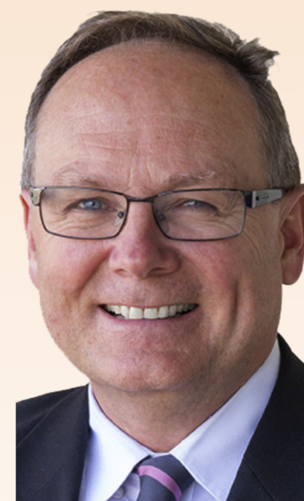
Minister for HERITAGE Hon David A Templeman