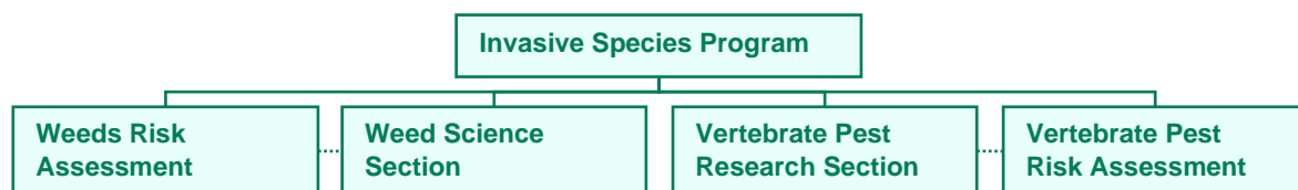
Figure 1 Previous structure of Invasive Species.

A strategic Invasive Species Plan (IS Plan) has been prepared for the IS Program. This has clear Actions and Targets to achieve five-year Outcomes: